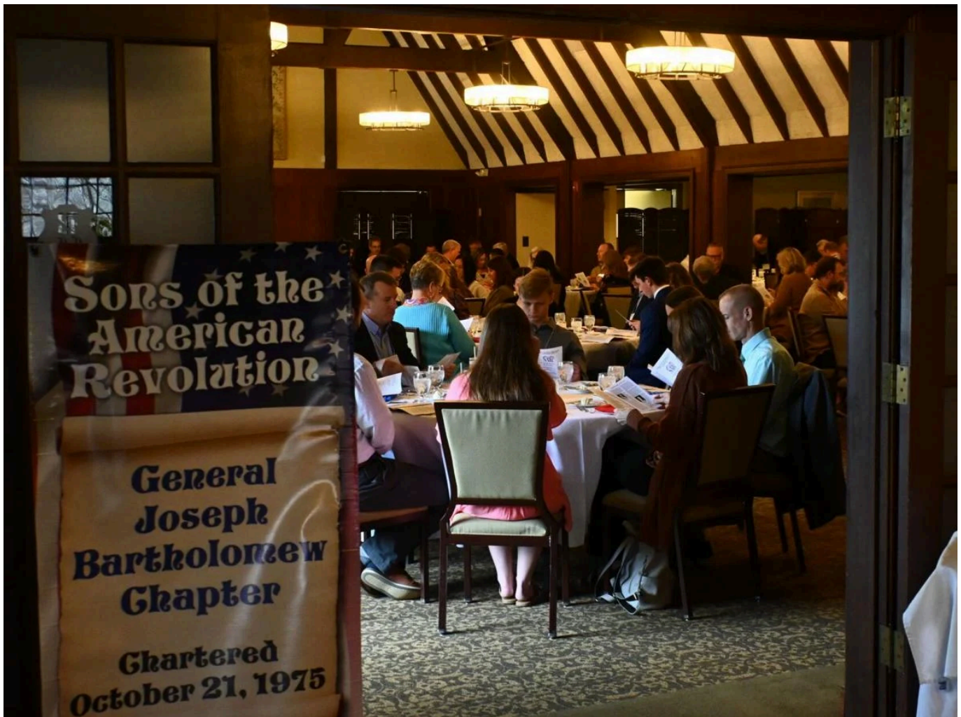
Twenty-one students and four adults were recognized at the 25th annual Citizenship Banquet held by the Gen. Joseph Bartholomew chapter of the Sons of the American Revolution on Thursday at the Bloomington County Club.